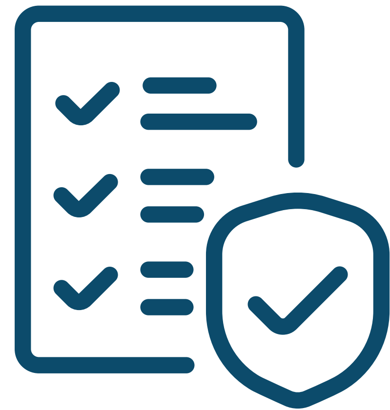
Policies & Programs to lower building costs