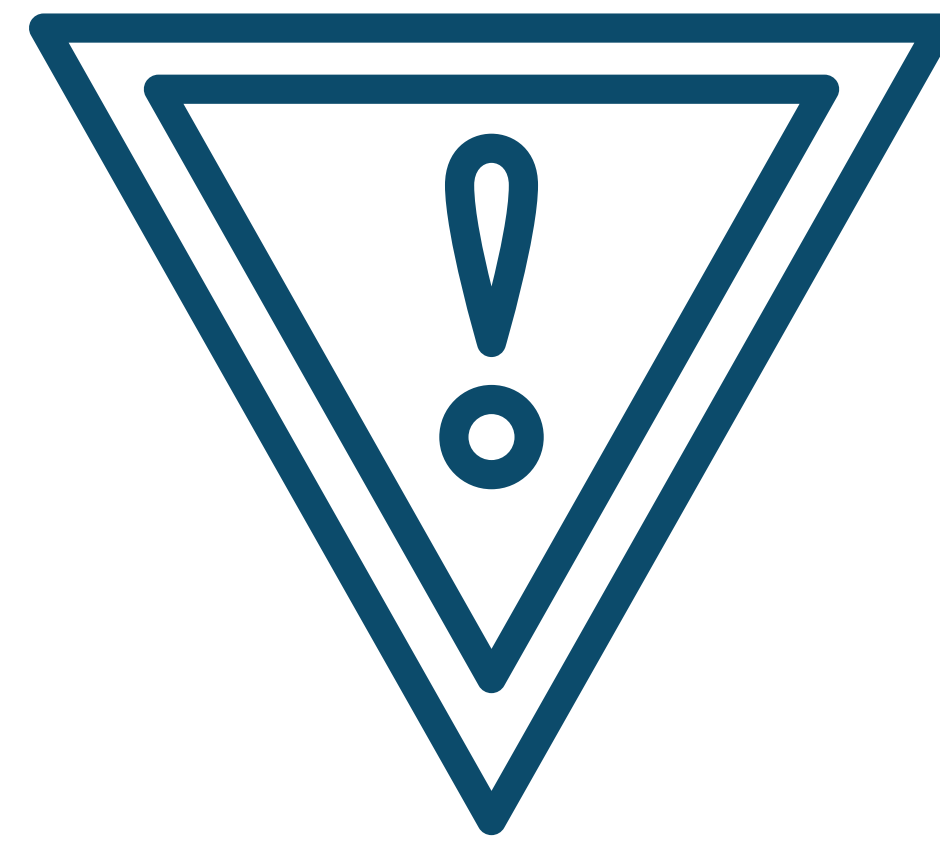
Decisions on KDFN-Only Areas