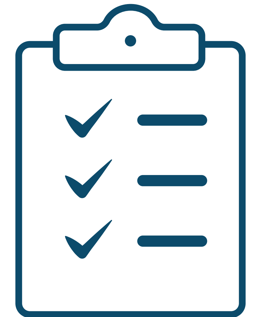
Tools to manage new land applications