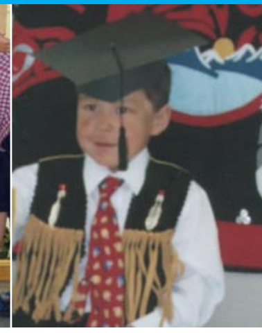
2006 HeadStart grad.