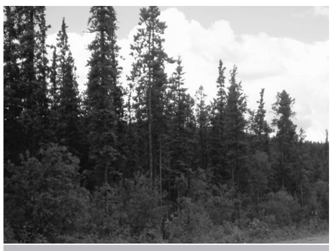
Woods in the KDFN Traditional Territory near Mount McIntyre.

Also from the Capital Department, KDFN has recently completed the first phase of the 2007 FireSmart contract for the Whitehorse Copper Subdivision, which is the new Yukon government development project in the Mount Sima area. The first phase saw 12 KDFN members employed to clear 25 hectares of wood. In the second phase, to happen this fall, KDFN members will clear and burn 6.5 kilometres of brush from the trails in the new subdivision.