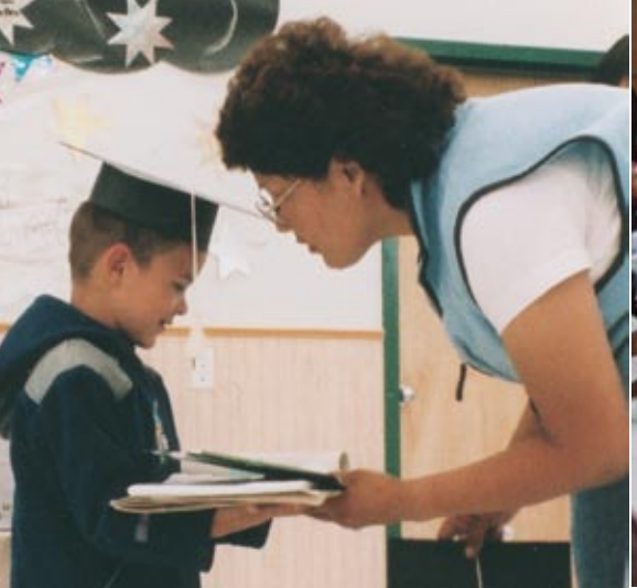
2006 HeadStart grad.