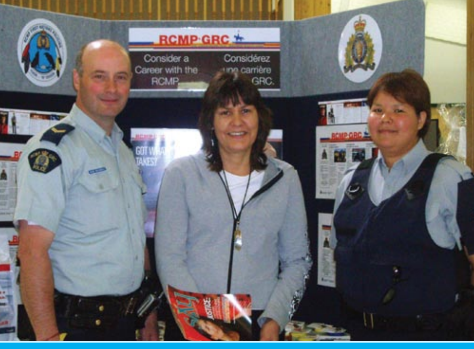
The RCMP was on hand during the 2007 Open House looking to recruit new members.

We will be known forever by the tracks we leave.