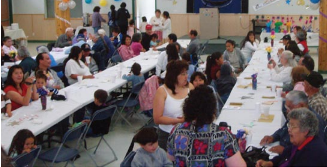
KDFN celebrates as a community at the 2007 HeadStart grad.