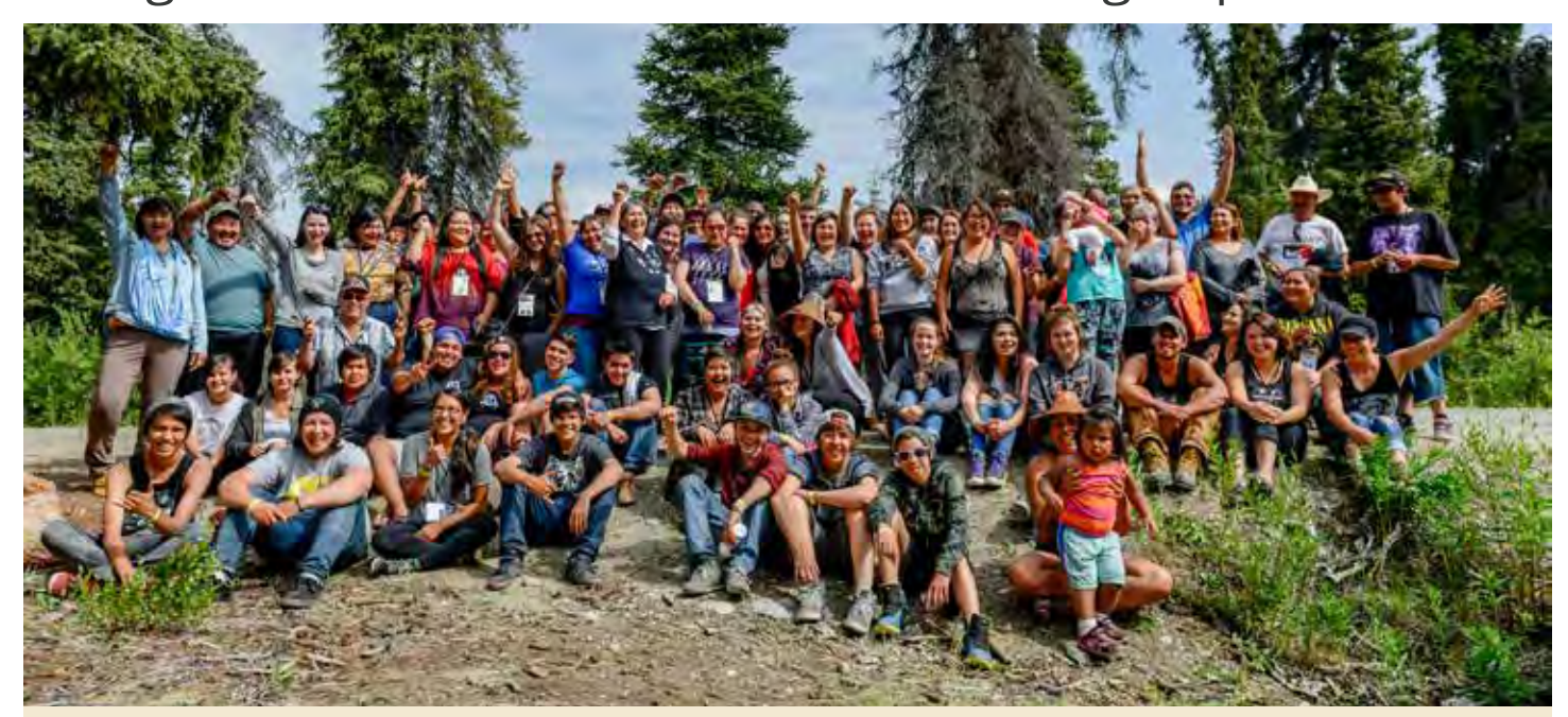
Over 100 youth from across the north participated in the three-day youth wellness gathering.

The Strength Within Circle: Youth Wellness Gathering empowered more than 100 youth to have healthy minds, bodies, spirits and hearts.