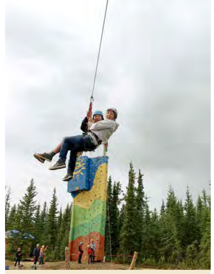
KDFN youth try ziplining during adventure-based summer program.