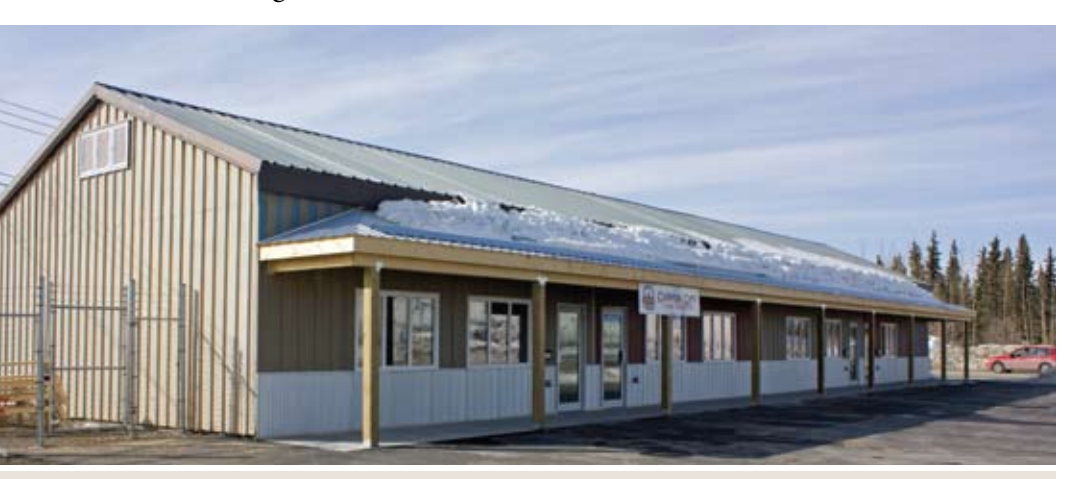
The new offices of Canyon City Construction are on the corner of Tlingit and Platinum. The KDFN company is a for-profit business that employs qualified citizens whenever possible.

The company started its work last May, employing a number of citizens to help completely redo the building.