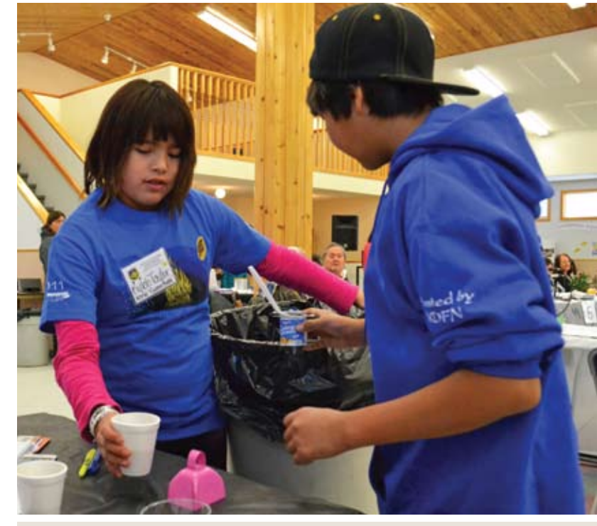
Thanks to all the youth "Gophers" who helped out at last fall's General Assembly. Your help is appreciated by the community!

This Agreement is just one example of the many ways that Kwanlin Dün Justice is partnering with the local RCMP in support of a greater policing presence and understanding of our community. It contributes to our vision of a safe, secure, closely-connected and thriving community.