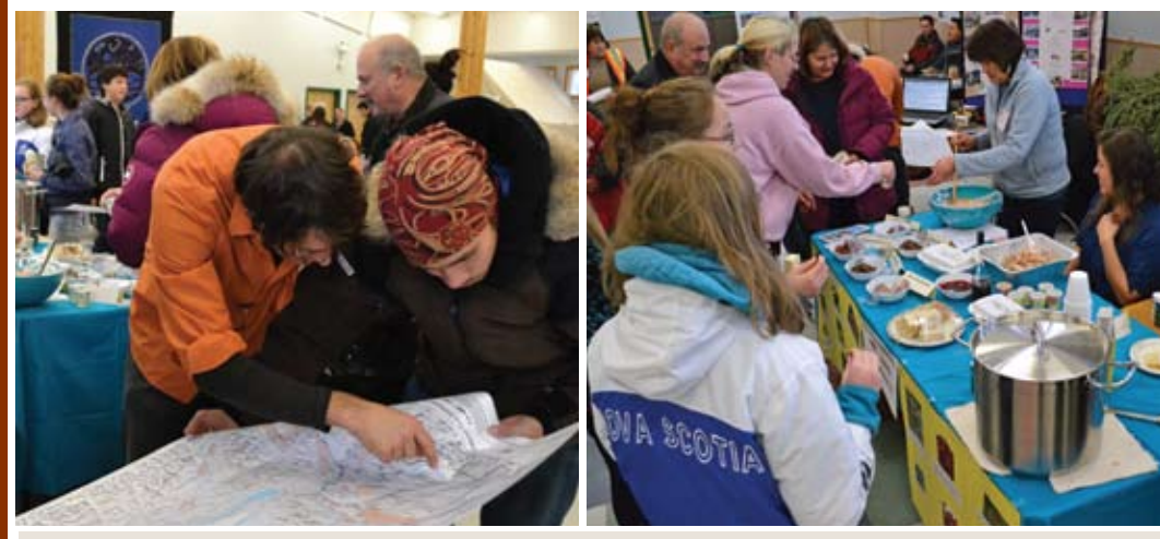
The day before the General Assembly in October 2012, KDFN departments held an open house. Many people came and learned more about our programs and services. They also provided staff with good feedback.

In the coming year we will be working hard, with your continued guidance and input, to implement the Strategic Plan. This Plan, which was also developed in consultation with the community, will help us create a stronger government and a healthier community.