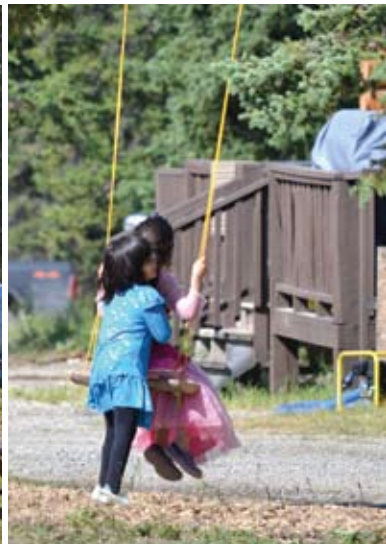
The General Assembly held at Jackson Lake in July was a great success. People really enjoyed the chance to be on the land and to visit with friends and family. The summer GA was held in response to citizens asking for more meetings and activities on the land.