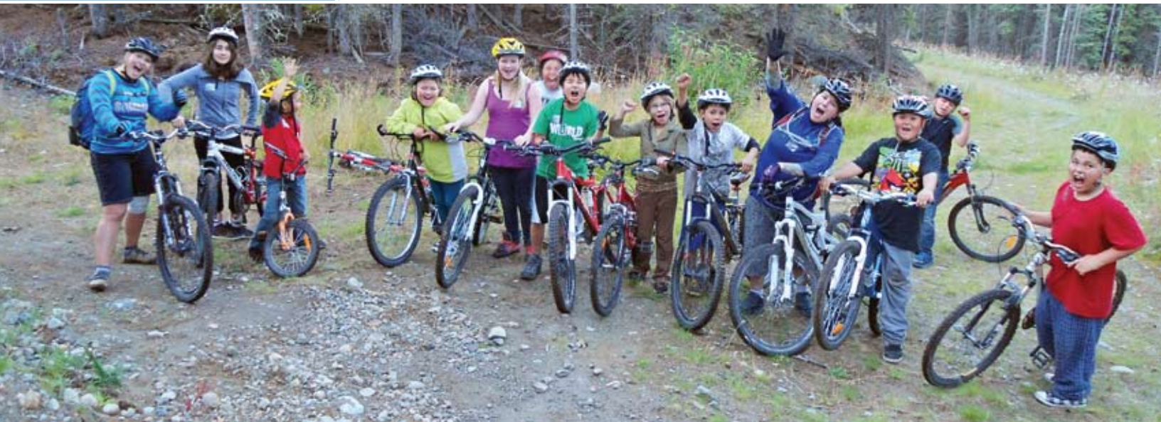
Many youth had fun learning new mountain biking skills at five clinics put on by KDFN and Boreale Mountain Biking.