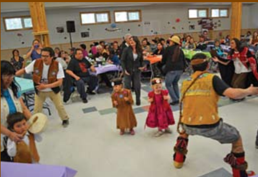
KDFN's new traditional dance group performed together for the first time at the KDFN Graduation Night in May. The dance group will be performing again at the Grand Opening of the Cultural Centre on June 21st.