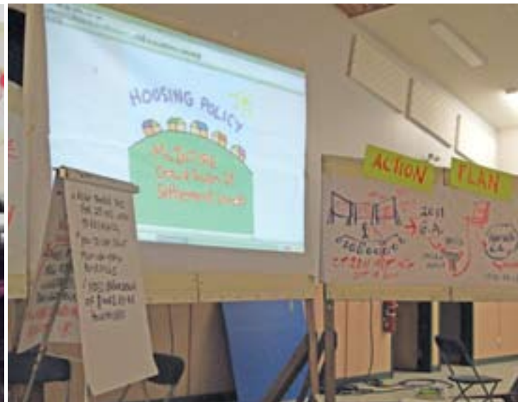
Many community members attended a meeting on housing last October to talk about the challenges KDFN's housing program faces and the future of housing in the community.