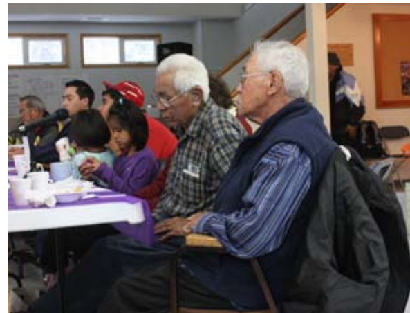
Elders, youth, community members and staff of KDFN participated in KDFN's General Assembly, November 5-7, 2010.