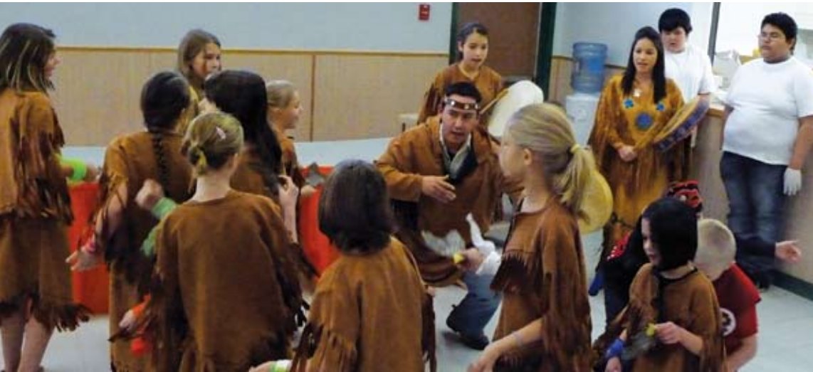
Elijah Smith School dancers entertained people at the 2010 General Assembly.

"Kwanlin people of Whitehorse, how are you?"