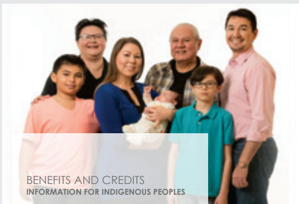
BENEFITS AND CREDITS INFORMATION FOR INDIGENOUS PEOPLES

For more information, go to: www.sixtiesscoopsettlement.info or call toll free: 1-844-287-4270 or email: sixtiesscoop@collectiva.ca .