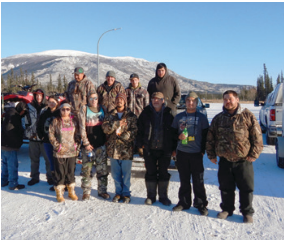
Above: Some of the Movember Circumpolar and Skills for Life, Land and Work participants who went on the bison hunt

Movember programming will continue on through the end of June 2018.