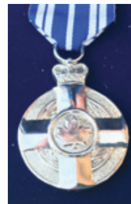
Above: Close up of the Meritorious Service Medal.