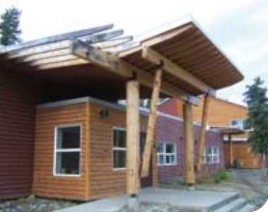
Kwanlin Dün's Health Centre provides health services to any Yukon citizen. Next door, there is a learning centre for young children. Kwanlin Dün also runs a land-based healing centre at nearby Jackson Lake.

The transition back from an Indian Act “band” to a self-governing First Nation has brought many changes.