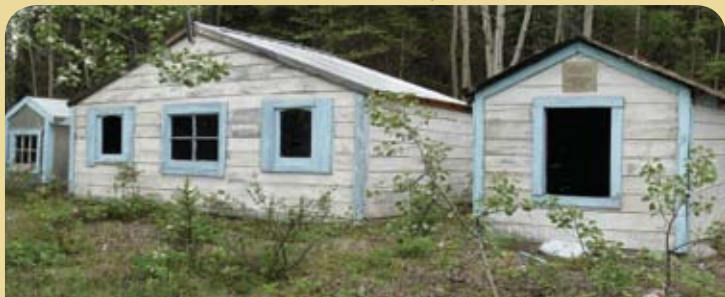
A few Kwanlin Dün Spirit Houses.

These and other First Nation burial sites are sacred places that are now protected under land claims agreements. Markers, spirit houses, and related artifacts and bones cannot be disturbed. Any accidental discovery of such a site, which might be found near old villages, camps and trails, must be reported.