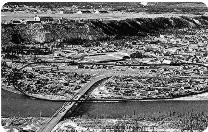
Whiskey Flats (circled above) was split in two when a bridge to the new subdivision of Riverdale was built. In the 1960s, people's homes in Whiskey Flats were demolished to make way for the SS Klondike on the south side and Rotary Park on the north.

These communities were home for many families over the years. Later, the neighbourhood of Whiskey Flats developed upriver, in the area between a bend in the Yukon River and the railway tracks.