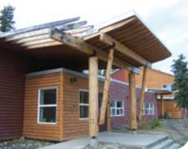
Kwanlin Dün's Health Centre provides health services to any Yukon citizen. Next door, there is a learning centre for young children. Kwanlin Dün also runs a land-based healing centre at nearby Jackson Lake. Kwanlin Dün First Nation

The transition back from an Indian Act “band” to a self-governing First Nation has brought many changes.