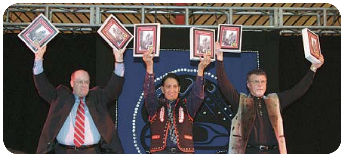
The Minister of Indian and Northern Affairs, Kwanlin Dün's Chief and the Yukon's Premier hold up the signed Final and Self-Government Agreements.

On April 1, 2005, after decades of negotiation and ratification by its citizens, Kwanlin Dün's Final and Self-Governing Agreements came into effect.