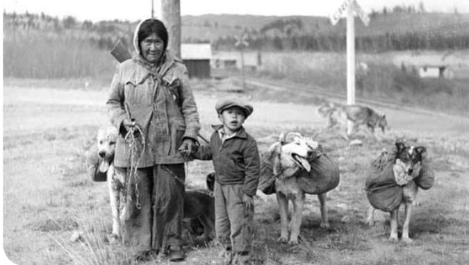
While some First Nation people settled in houses in Whitehorse, others continued to live more traditionally on the land. They came to town to get some supplies and visit. This photo was taken around 1950.

In the 1950s, as Whiskey Flats filled up, the Shipyards area expanded. The newest grouping of homes became known as Sleepy Hollow.