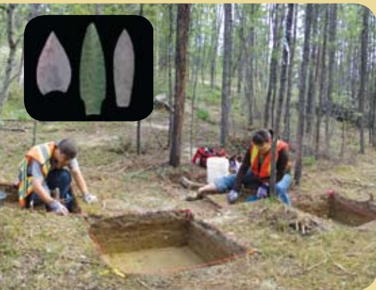
Youth working on a dig near Whitehorse. Inset shows artefacts from other projects.

For many years Kwanlin Dün has worked with the Government of Yukon and other First Nations on a number of archeological digs in our traditional territory.