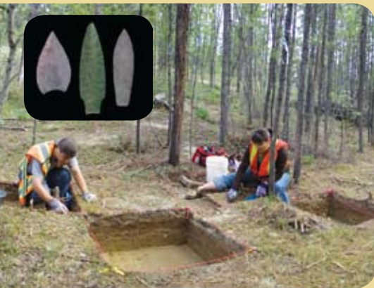
Youth working on a dig near Whitehorse. Inset shows artefacts from other projects.

For many years Kwanlin Dün has worked with the Government of Yukon and other First Nations on a number of archeological digs in our traditional territory.