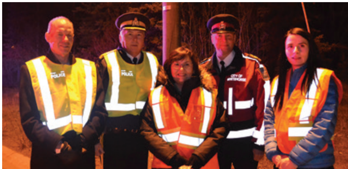
Halloween 2015 Vehicle Roadside Stop-check in McIntyre

Relationships with other agencies are improving through an interagency working group that includes officials from KDFN Justice, City of Whitehorse By-Law, Correctional Service Canada, Government