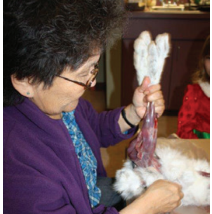
Children learning about dog safety and rabbit skinning