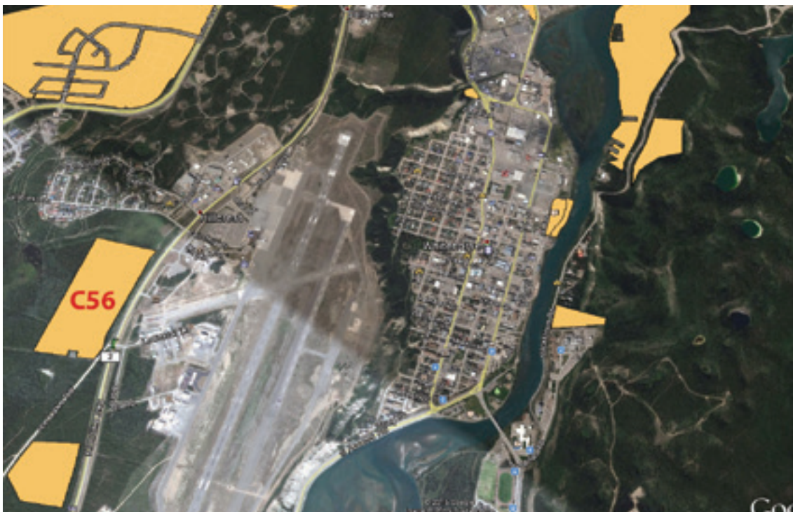
C-56 parcel, Whitehorse International Airport, downtown Whitehorse and other parcels of KDFN settlement land (highlighted)

For more information contact eileen.duchesne@kdfn.net or (867) 633-7826