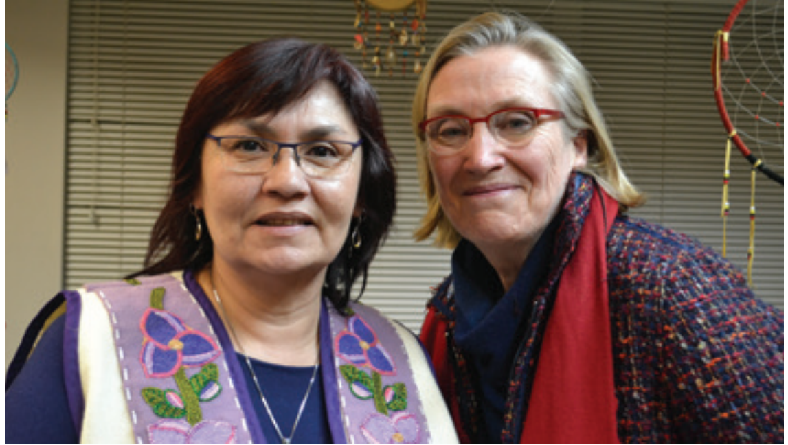
Minister of Indigenous and Northern Affairs meets with KDFN Council, January 2016