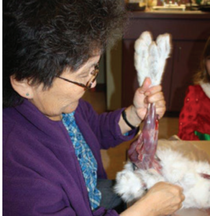
Children learning about dog safety and rabbit skinning